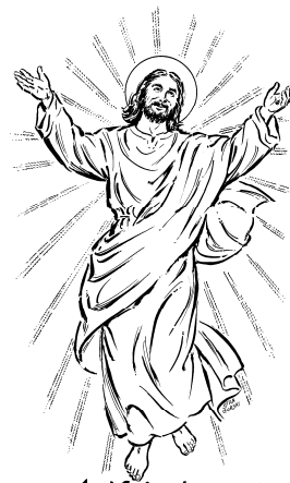
Christ is risen